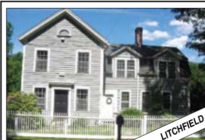
Charming Antique. 3 Bedrooms. 3 Fireplaces. Natural Pond. Garage with Storage. 4± Acres. SUPERB $429.000.