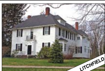
Restored In-town Victorian Colonial. 6 Bedrooms. 3 Fireplaces. 1± Acres. MUST SEE $1.695.000.