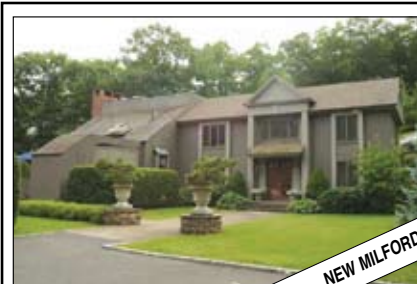
Neoclassic Contemporary. 3 Bedrooms. Open Floor Plan. 4.75± Acres. Country Setting. WHY NOT $1.095.000.