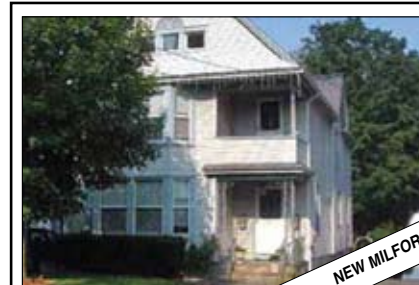
In-town Vintage Multi-Family. 5 Bedrooms. Bay Windows. Wood Floors. OPPORTUNITIES $450.000.

Please visit my website hammerhouses.com