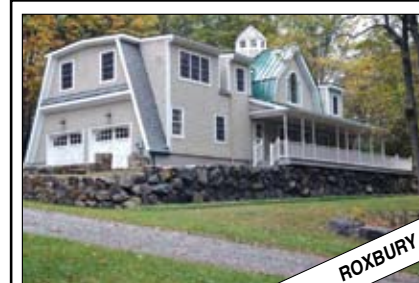
Quality New Construction. 4 Bedrooms. Fireplace. 4± Acres. Great Location. EXCLUSIVE $1.295.000.