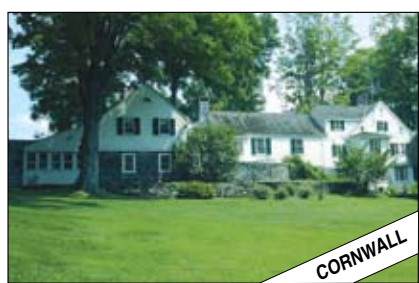
Stony Batter Farm. Guesthouse. Outbuildings. 100± Acres. Equestrian Property. CLASSIC $4.750.000.