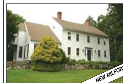
1776 Renovated Antique. 4 Bedrooms. Guesthouse. Pool. 14.9± Acres. Idyllic Setting. OFFER $1.795.000.