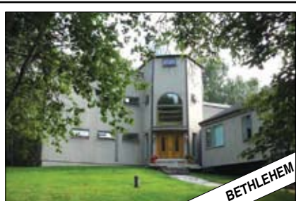
Light-filled Contemporary. 3 Bedrooms. Indoor Wave Pool. Studio/Cottage. 2.4± Acres. UNIQUE $795.000.