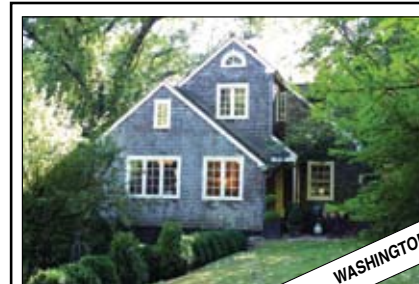
Nantucket Cottage. 3 Bedrooms. Close to Town Amenities. Privacy. 2.2± Acres. RARE $895.000.