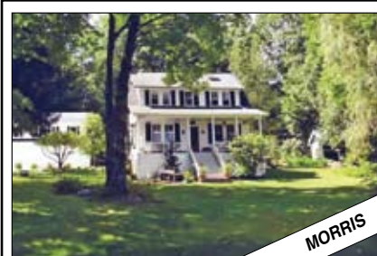
Waterfront Compound on Bantam Lake. 1920's Cottage. Guesthouse. 2± Acres. WOW $1.575.000.