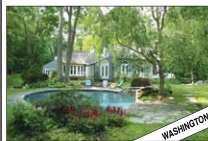
Exceptional Country Property. 5 Bedrooms. Pool. Tennis Court. 5.24± Acres. LOCATION $1.995.000.