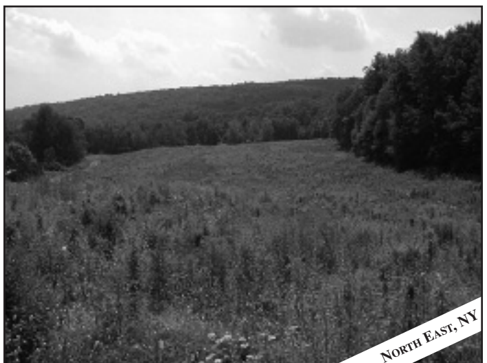
NORTH EAST, NY

105± Acres. Hidden Meadows. Premier Parcel. Views. Meadows. Woods. Stonewalls. Pond. Stream. Trails. Desired Location. $2,100,000. Drew Hingson. 860.435.6789.