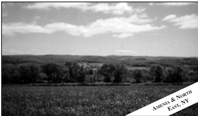
AMENIA & NORTH EAST, NY

86.5± Acres. Stunning Farm. Multiple House Sites. Converted Barn. Streams. Pond. Meadows. Westerly Views. Glorious Sunsets. Minutes to Train. $2,950,000. Roger Saucy. 860.868.7313.