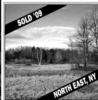
SOLD '09 Smithfield Valley. 113± Acres. Estate Parcel. Catskill Views. SOLD! ASK $3.0m. Drew Hingson.