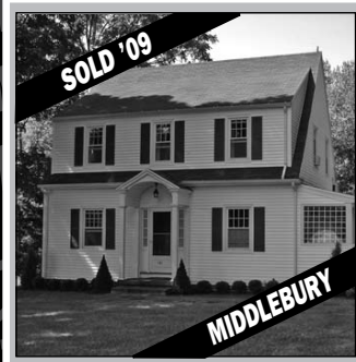
SOLD '09 Adorable 1931 Colonial. 3 Bedrooms. Fireplace. Garage. SOLD! ASK $295k. Beverly Mosch. Sindy Butkus.