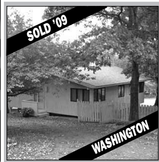
SOLD '09 Private Bungalow. 2 Bedrooms. Views. 2± Acres. SOLD! ASK $475k. Jim Appleyard.