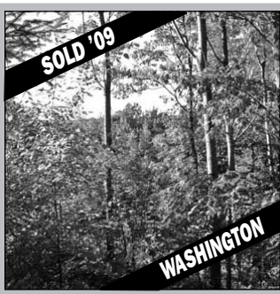
SOLD '09 1.08± Acres. Wooded Parcel above Lake Waramaug. SOLD! ASK $129.9k. Peter Klemm.