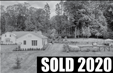
SHARON, CT ASK $1.175m