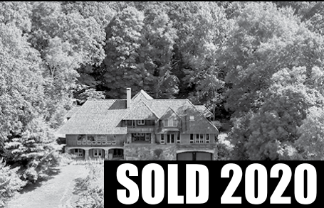
HIGHEST SALE YTD KENT, CT ASK $2.5m

c1932 Modernist Residence & Studio/Workspace. 4 Bedrooms. Separate 2-Car Garage. Stone Terrace. Fire Pit. Trails. Brooks. Waterfalls. Gardens. 90± Acres. Graham Klemm. 860.868.7313.