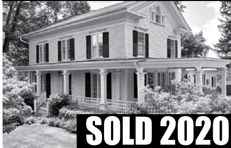
SHARON, CT ASK $725k