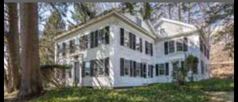
18th Century Colonial. 5 Bedrooms. 3.5 Baths. Classic Barn. Lake Waramaug Views. Subdivision Potential. 4.1± Acres. $815,000.