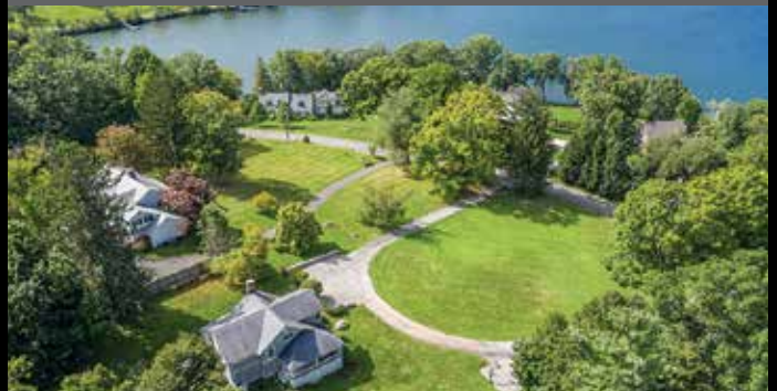
Idyllic Lake Waramaug Shingle-style. 3 Bedrooms. 2.5 Baths. Fireplace. Covered Porch. Stone Patio. Sweeping Lawn. Boathouse. Floating Dock. 2.85± Acres. $4,500,000.