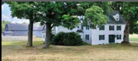
Horse Property. 3 Houses. Barns. 45+ Stalls. Paddocks. Indoor Riding Ring. 9 Separate Parcels. Views. 155± Acres. $2,395,000.