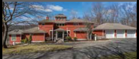
Private Postmodern. 4 Bedrooms. 4.5 Baths. 2 Fireplaces. Gym. Surrounded by Protected Land. 5.51± Acres. $699,000.