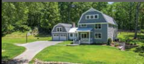
Stunning Complete Modern Renovation. 4 Bedrooms. Fireplace. Open Floor Plan. New Heated Gunite Pool. 3-car Garage. 4.24± Acres. $1,795,000.