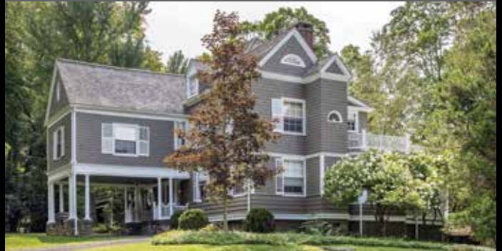
Stunning Ehrick Rossiter Designed Home. 7 Bedrooms. 6.5 Baths. 4 Fireplaces. Screened Porch. Pool. Cabana. Views. Abuts Steep Rock. 5.4± Acres. $3,495,000.