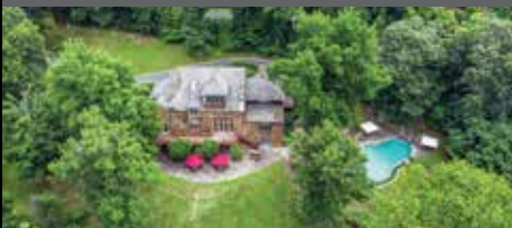
Baronial House on Lake Lillinah Waterfront. 5 Bedrooms. 4 Fireplaces. Pool. Dock. Views. 3-car Garage. 5.02± Acres. $2,900,000.