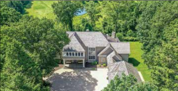
Newly Renovated Stone & Shingle Estate. 5 Bedrooms. 3 Fireplaces. Pool with Cabana. Dramatic Views Overlooking Steep Rock. Privacy. 8.23± Acres. $4,250,000.