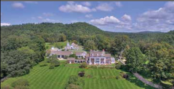
Exquisite Country Compound. Brick Georgian Manor House. 3 Additional Independent Residences. Barns. Pool. Tennis. Pond. Stonewalls. Gardens. 187± Acres. $5,995,000.