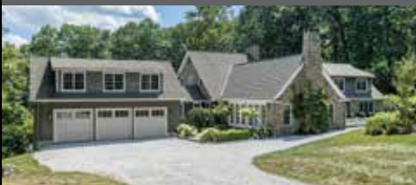
Private & Chic Country House. 4 Bedrooms. 2 Fireplaces. Infinity Edge Pool. 3-car Attached Garage. 7.63± Acres. $2,750,000.