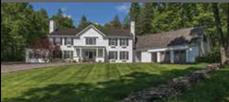
Expansive Colonial. 5 Bedrooms. 7 Fireplaces. Pool. Terraces. 2-car Garage. Top Location. 15.23± Acres. $2,950,000.