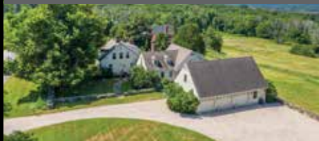
Rare One-of-a-kind Property. 4-5 Bedrooms. 4.5 Baths. 5 Fireplaces. 3-Bay Garage. Close to Town & Amenities. 5± Acres. $1,495,000.