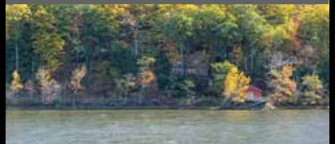
Lake Waramaug Waterfront. 1930s House & Boathouse. 2 Bedrooms. Fireplace. Deck. Beach. Lake Views. $420,000.