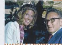
NANCY & HENRY KISSINGER