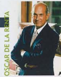
OSCAR DE LA RENTA