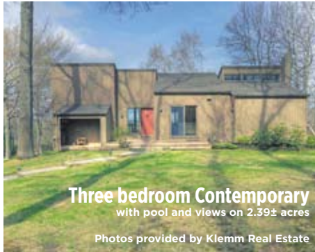
Three bedroom Contemporary with pool and views on 2.39± acres