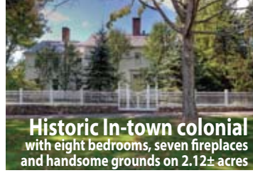
Historic In-town colonial with eight bedrooms, seven fireplaces and handsome grounds on 2.12± acres