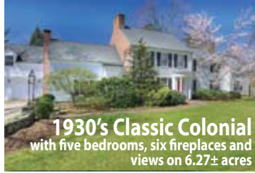
1930's Classic Colonial with five bedrooms, six fireplaces and views on 6.27± acres