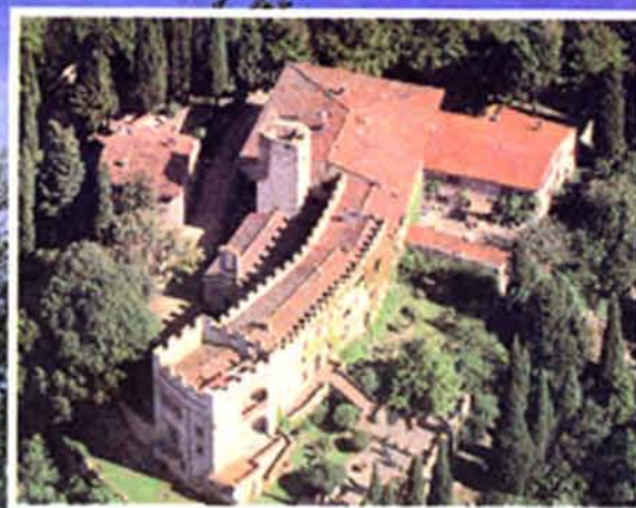
CASTELLO DI MONTACUTO! To learn more about this 11th Century wonder, please see Stribling advertisement on Page 2.