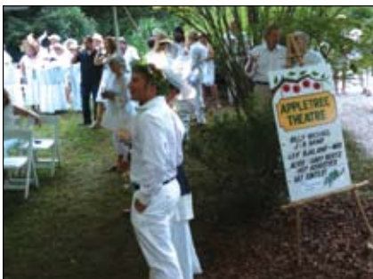
Who won? Who won? Who won? And the winner is....