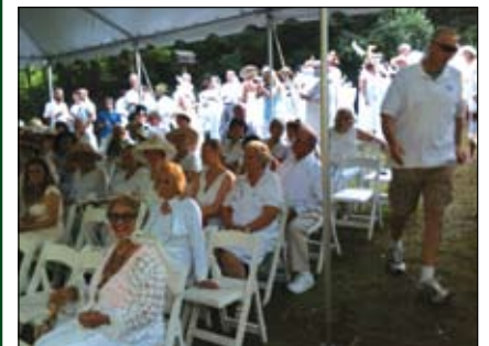
I wonder if my favorite will win.