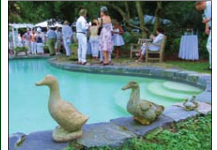
ARE WE LATE???