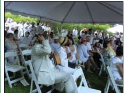
The crowd watches the hat contest in rapt attention. Everybody always has a great time cheering their favorites.