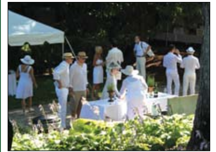
Thirsty guests refill at one of the three bars. Cases of wine were consumed and, of course, lots of iced tea!