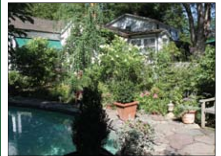
A quiet corner of the garden by the pool soon to be filled with party goers.