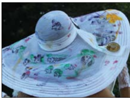
This year's Mad Hatter contest winner triumphed over 20 other contestants. Joan Crawford was the judge.