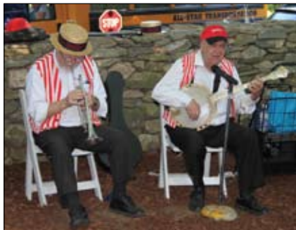
The Bearcats from Newtown played hot Dixieland jazz to arriving throngs and did a great job.