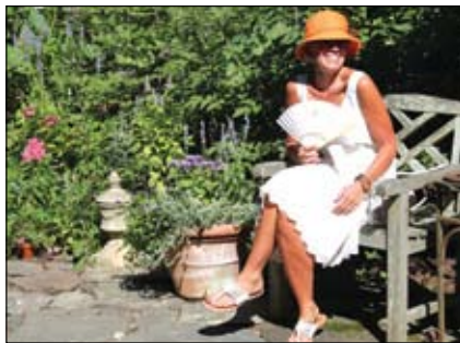
"I Feel Pretty, Oh, So Pretty!" Now tell me, who's the fairest flower of all?!