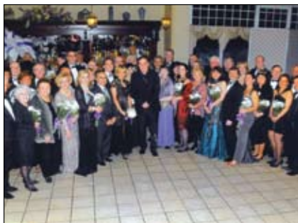
20 Years of Co-chairs gather to celebrate Saint Mary's 20th Anniversary.