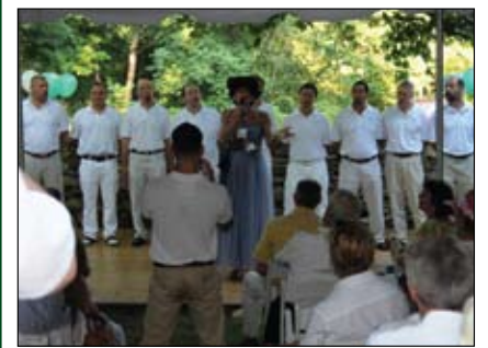
Miss Joan Crawford entertains with a song and dance number - backed by the Connecticut Gay Men's Chorus.